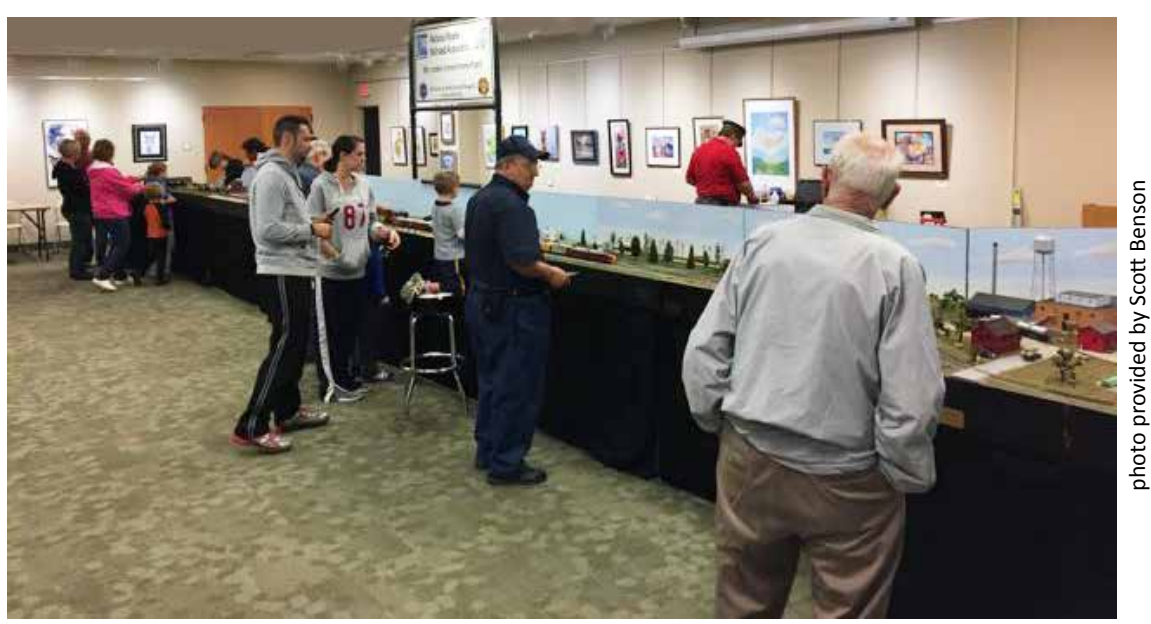
Display at the Avon Lake Library.

We hope that Div 4 members get a chance to come out to the Fifth Annual International Tree and Model Train Display at the Black River Transportation Center in Lorain. The event starts on November 26, and runs every weekend through December 30. Bring a DCC train with you and run on the layout with the group!