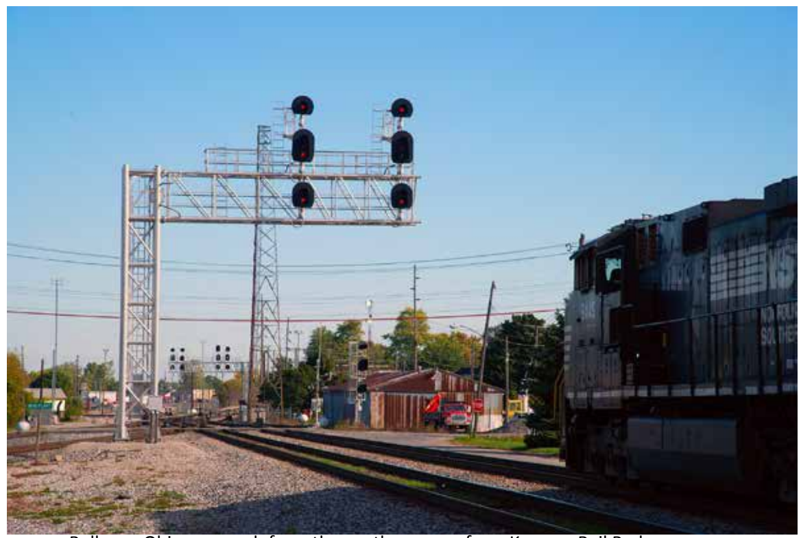
Bellevue Ohio approach from the south, as seen from Kemper Rail Park.

Official newsletter of Division Four, Mid Central Region of the National Model Railroad Association.